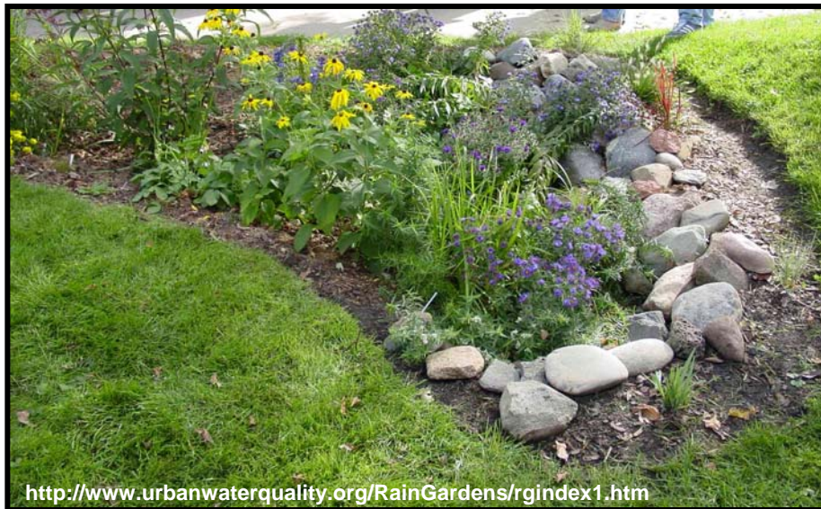
Figure 2: Rain gardens also have aesthetic value.