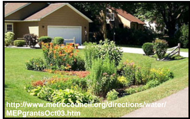
Figure 3: This rain garden treats road and driveway runoff.

Siting Rain gardens should be located within approximately 30 feet of the downspout or impervious area treated. Rooftop conveyance to the rain garden is through roof leaders directed to the area, with stone or splash blocks placed at the point of discharge into the rain garden to prevent erosion. Runoff from driveways and other paved surfaces should be directed to the rain garden at a non-erosive rate through shallow swales, or allowed to sheet flow across short distances (Figure 3).